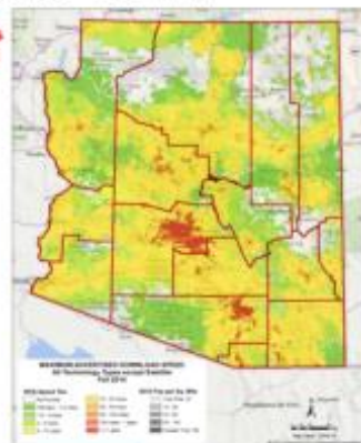
Arizona Broadband Coverage Table for Fall 2014